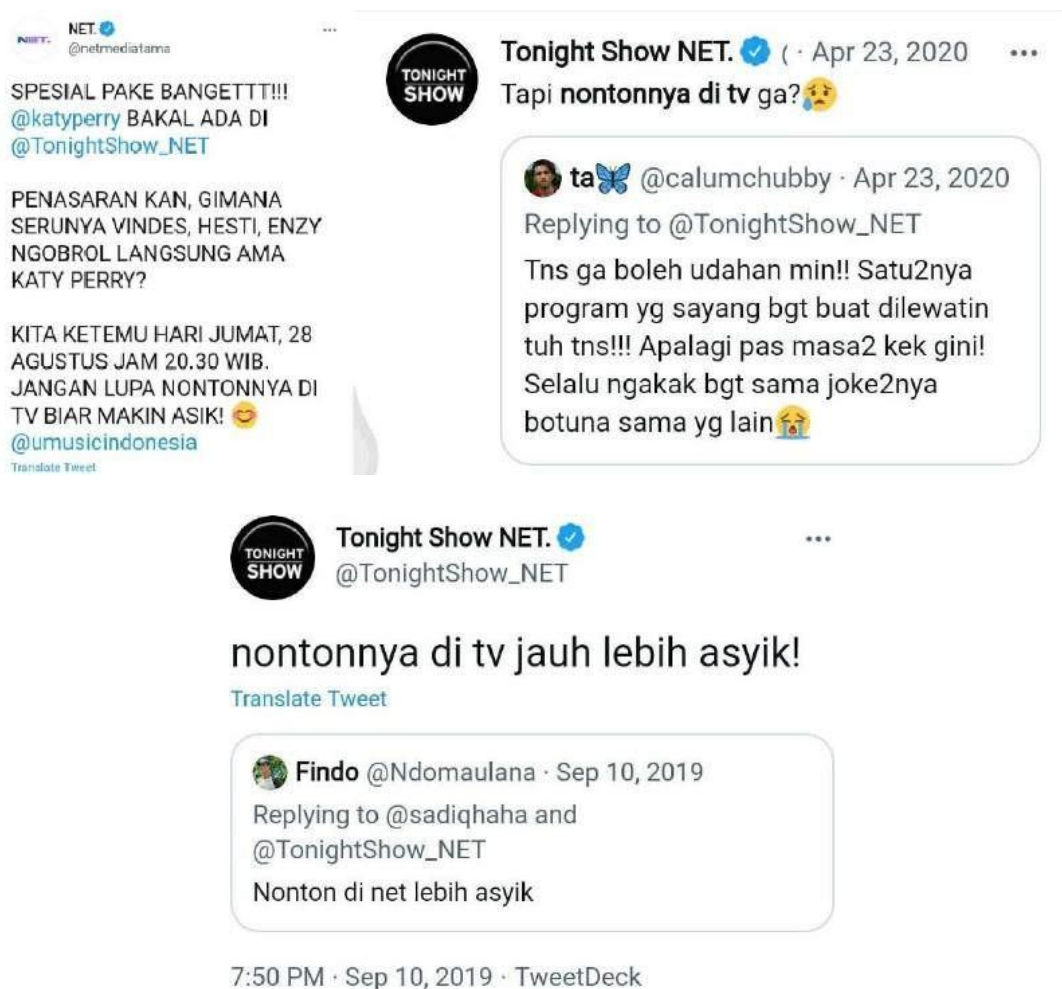
Figure 1.1 "Watch on tv" Campaign Content on Twitter

Tonight Show is a television program owned by NET TV, which had its broadcast hours closed for one month in May 2020. Edo Wicaksono, vice president of production for Tonight Show, said what happened to the Tonight Show program because it was one of the shows with the lowest ratings. Most of the audience are millennials or digital natives who are more into digital content than watching television. With the cancellation of the Tonight Show program or the expected goal is that tonight lovers (the name for viewers of the Tonight Show program) can become agents to voice the "Watch on TV" campaign and become a new movement to watch TV. Before until after the broadcast was closed, the Tonight Show program, through its Twitter and Instagram social media, enlivened the "Watch it on TV" campaign for tonight lovers to help raise the rating of the Tonight Show on television.