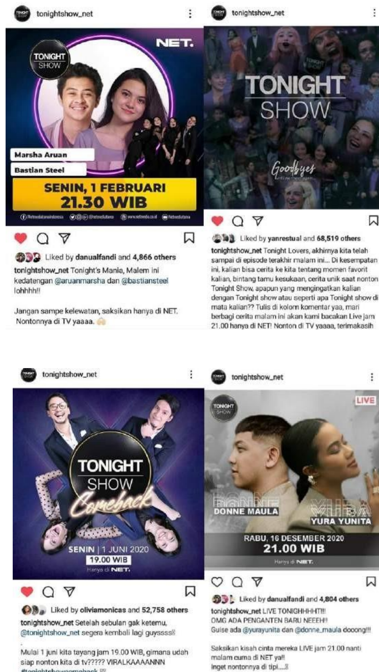
Figure 1.2 “Watch on tv” Campaign Content on Instagram

With the rise of media convergence from television to YouTube, NET finally made peace with the situation by maximizing the use of YouTube social media to broadcast their programs live to maintain their existence. Previously, NET TV used the live streaming feature of all its program on the YouTube platform. However, entering 2021, this feature had begun to be reduced in access, as before, if viewers missed the broadcast time of a program, they could withdraw the program from showing until they reached the