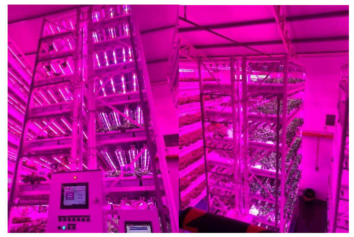
Figure 2.The Plant Factory is located at MARDI

As part of its revenue stream, the Plant offers training services in addition to selling its premium products. These training programs aim to enhance the skills of entrepreneurs and improve their understanding of modern technology applications. By offering a range of premium products and training services, the group seeks to diversify its sources of income, thereby strengthening its financial stability and fostering business growth.