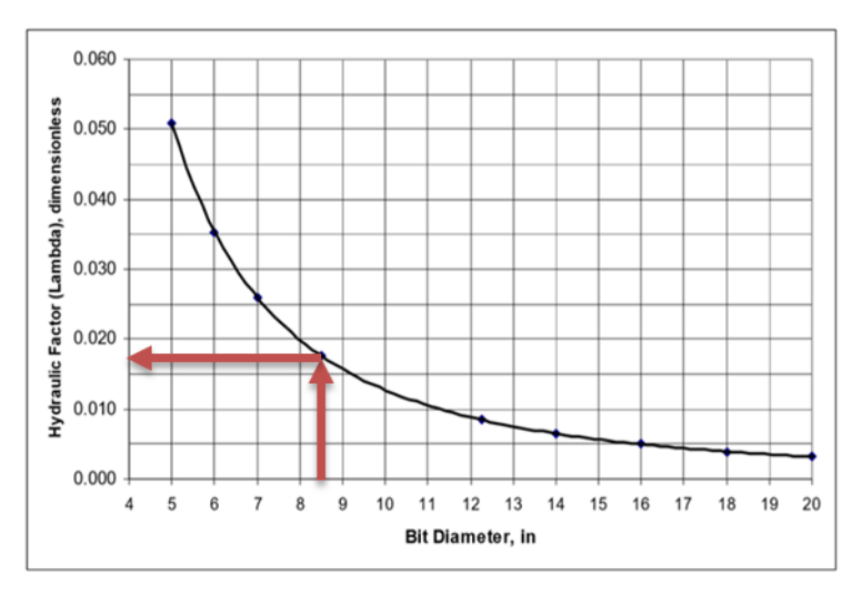
Figure 1. Determination of Hydraulic Factor

The following is the determination of the hydraulic factor ( \lambda );