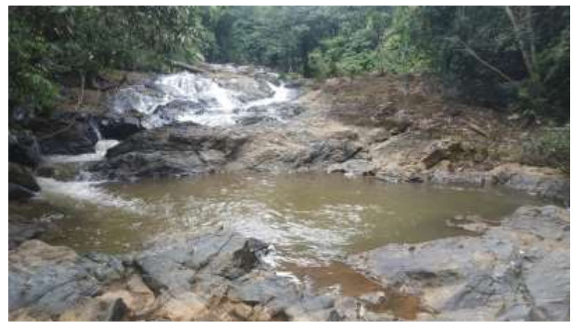
Figure 11. Lempesu Waterfall morphology.

at the contact between the Jurassic Ultramafic Complex (Ju) and the Cretaceous Haruyan Formation (Kvh). The lithology found at this location includes basaltic lava presumed to be from the Haruyan Formation and serpentinite presumed to be from the Ultramafic Complex. These lithologies are intersected by a horizontal fault, which also acts as the contact between the formations. Additionally, intense jointing has intersected these lithologies, creating an appearance of layering. Furthermore, limestone lithology, originating from the Kuaro Formation (Tek), can be found unconformably overlying the basaltic lava and serpentinite. In certain areas, limestone formations form caves. Lempesu Waterfall exhibits a cascading morphology with relatively low cascades, ranging from 1 to 4 meters in height. The water flow is quite vigorous with clear water. The natural environment around the waterfall is well-preserved. At some points along the waterfall, calm pools are formed, allowing tourists to enjoy water activities in addition to the waterfall itself.