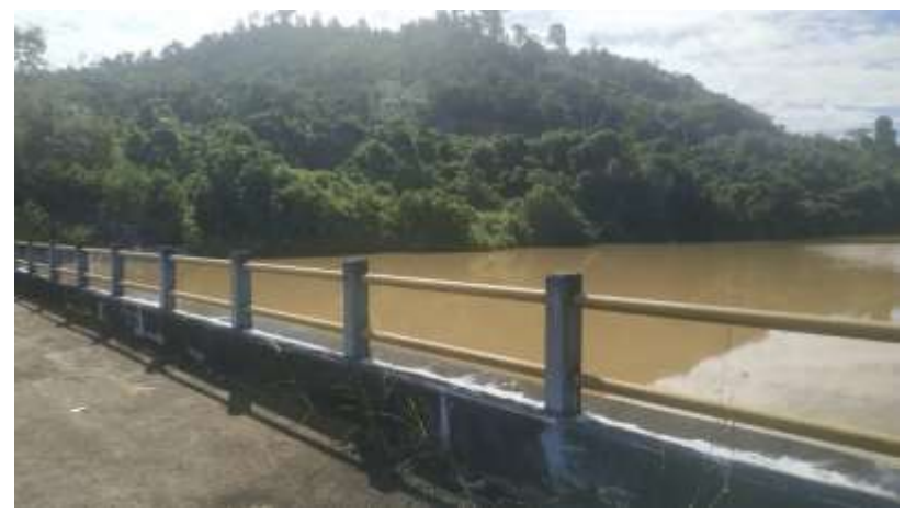
Figure 5. Morphology of Muru Dam.

from Kuaro. Muru Dam is situated at an elevation of 61 meters above sea level. According to the Geological Map of the Balikpapan Sheet by Hidayat and Umar (1994), this location is within the Jurassic Ultramafic Complex (Ju). The lithology found at this location consists of serpentinite and hazburgite. These lithologies exhibit a highly intense jointing. Muru Dam is a man-made reservoir created by damming the Muru River, primarily for irrigation purposes in the surrounding area. This location is suitable for learning about dam morphology and geotechnical aspects related to earth sciences. Additionally, there are outcrops of rock formations along the dam's edge, which can serve as educational materials. The beautiful scenery and pristine atmosphere make this place a good spot for photography for tourists.