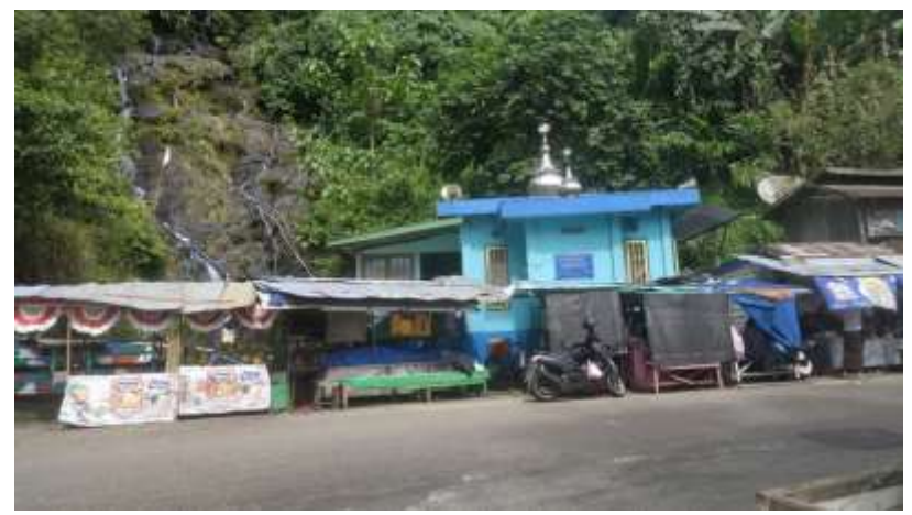
Figure 6. Mount Rambutan Waterfall.

Mount Rambutan Waterfall (Figure 6) is located at coordinates 1.813404°S and 116.001517°E, situated in Sungai Terik Village, Batu Sopang District. Access to this location is available by road, taking approximately 1 hour from Tanah Grogot or about 30 minutes from Batu Kajang. Mount Rambutan Waterfall is situated at an elevation of 231 meters above sea level. According to the Geological Map of the Balikpapan Sheet by Hidayat and Umar (1994), this location is within the Jurassic Ultramafic Complex (Ju). The lithology found at this location consists of serpentinite and hazburgite, both exhibiting intense jointing. Mount Rambutan Waterfall is a cascade of water falling from a height of approximately 15 meters. The water flow is quite vigorous with clear water. The natural environment around the waterfall is well-preserved. There is a pool at the base of the waterfall, allowing tourists to enjoy water activities. This geotourism location is situated alongside the main road, making it a resting spot for travelers on long journeys.