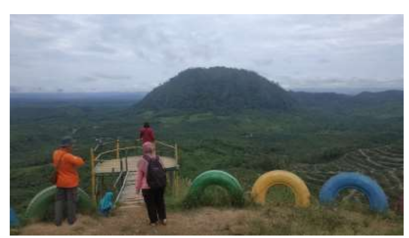
Figure 10. Morphology of Mount Boga.

Mount Boga, also known as Mount Embun (Figure 10), is located at coordinates 1.948006°S and 116.002280°E, situated in Luan Village, Muara Samu District. Access to this location is available by road, taking approximately 1 hour from Tanah Grogot. Mount Boga is a hilly landform at an elevation of 215 meters above sea level. According to the Geological Map of the Balikpapan Sheet by Hidayat and Umar (1994), this location is within the Jurassic Ultramafic Complex (Ju). The lithology found at this location consists of serpentinite and hazburgite. These lithologies exhibit highly intense jointing, and some quartz veins are also present. Mount Boga represents an elevation with a beautiful surrounding morphological landscape. In the morning, the lower surrounding areas are often covered in mist, giving the impression that this location is above the clouds. This location is a great spot for photography for tourists, offering picturesque landscapes and rock outcrops. Furthermore, it also serves as a camping site for adventurous travelers who enjoy outdoor experiences.