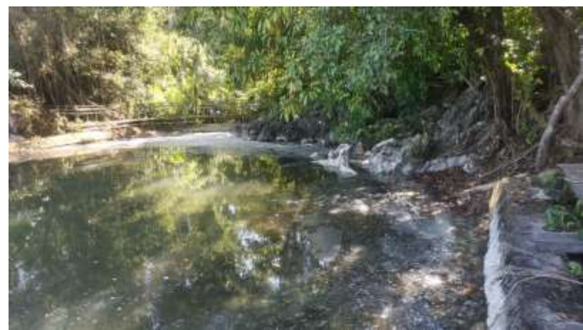
Figure 3. Danum Layong Hot Spring.

Danum Layong Hot Springs (Figure 3) is located at coordinates 1.534505°S and 116.309592°E in Long Kali Village, Long Kali District. Access to this location is available by road, taking approximately 2 hours from Tanah Grogot or about 1.5 hours from Penajam. Danum Layong Hot Springs are situated at an elevation of 16 meters above sea level. According to the Geological Map of the Balikpapan Sheet by Hidayat and Umar (1994), this location is within the Early Miocene Bebulu Formation (Tmbl). The lithology found at this location consists of massive limestone with intense jointing. The limestone represents part of a coral reef body, with the presence of coral fragments and mollusk shells. Danum Layong Hot Springs are believed to be a non-volcanic geothermal manifestation. The location features slightly turbid warm water with a distinct sulfuric aroma. There are pools that contain the hot spring water, allowing tourists to enjoy water activities. In addition to its scenic photographic opportunities, visitors can observe the presence of organisms on the limestone.