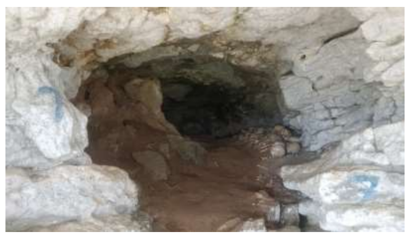
Figure 8. Tengkorak Cave entrance.

Tengkorak Cave (Figure 8) is located at coordinates 1.804252°S and 115.913034°E, situated in Kasungai Village, Batu Sopang District. Access to this location is available by road, taking approximately 15 minutes from Batu Kajang or about 2 hours from Tanah Grogot. Tengkorak Cave is a natural cave formation in a karst hill at an elevation of 68 meters above sea level. According to the Geological Map of the Balikpapan Sheet by Hidayat and Umar (1994), this location is within the Late Eocene Tanjung Formation (Tet). The lithology found at this location consists of layered limestone with a thickness of approximately 10 meters. The rocks also exhibit intense jointing and contain larger foraminifera like Lepidocyclina. Tengkorak Cave is a natural cave formed through the process of karstification. It earned its name due to the presence of several human skulls and bones found in the cave. These skulls were placed in the cave by the local community in the past as a final resting place, just like in the Toraja region. The cave has an entrance that is not very large but can be navigated by adults. The natural environment around the cave is well-preserved. In addition to being a great spot for photography, visitors can observe the presence of organisms in the limestone. The location also features a river area, providing water-based recreational activities for tourists, with clear water and a relatively gentle current.