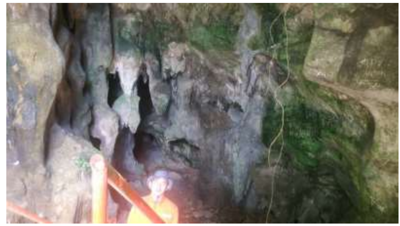
Figure 9. Losan Cave ornaments.

sea level. According to the Geological Map of the Balikpapan Sheet by Hidayat and Umar (1994), this location is within the Oligocene to Early Miocene Berai Formation (Tomb). The lithology found at this location consists of thick massive limestone. The limestone is part of a reef body, containing fragments of corals and mollusk shells. Losan Cave is a natural cave formed through the process of karstification. The cave features various formations, including stalactites and stalagmites. The cave has an entrance that is not very large but can be navigated by adults. The natural environment around the cave is well-preserved. In addition to its suitability for photography, visitors can observe the presence of organisms in the limestone.