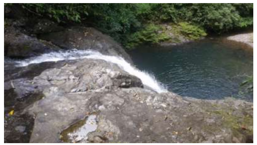
Figure 4. Doyam Seriam Waterfall.

Doyam Seriam Waterfall (Figure 4) is situated at coordinates 1.697469°S and 116.064644°E, located in Modang Village, Kuaro District. Access to this location is available by road, taking approximately 2 hours from Tanah Grogot or about 1 hour from Kuaro. Doyam Seriam Waterfall is situated at an elevation of 169 meters above sea level. According to the Geological Map of the Balikpapan Sheet by Hidayat and Umar (1994), this location is within the Jurassic Ultramafic Complex (Ju). The lithology found at this location consists of serpentinite and hazburgite with intense jointing. Quartz veins are also observed within the rocks. Doyam Seriam Waterfall exhibits a cascading morphology with relatively low cascades, ranging from 1 to 5 meters in height. The water flow is quite vigorous with clear water. The natural environment around the waterfall is well-preserved. At certain points along the waterfall, calm pools are formed, allowing tourists to enjoy water activities in addition to the waterfall itself. The waterfall is situated in a hilly area, making it a potential camping site for adventurous tourists who enjoy the outdoors.