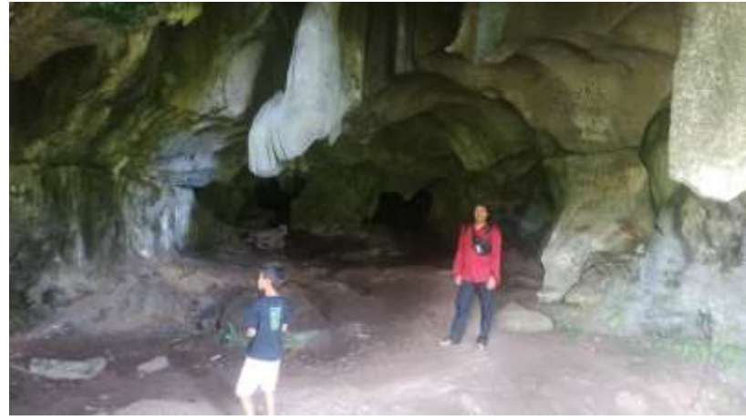
Figure 7. Loyang Cave entrance.

limestone. The limestone is part of a reef body, containing fragments of corals and mollusk shells. Loyang Cave is a natural cave formed through the process of karstification. Various formations, including stalactites and stalagmites, can be found within the cave. The cave has a sizable entrance. The natural environment around Loyang Cave is well-preserved. In addition to its suitability for photography, visitors can observe the presence of organisms in the limestone. The morphology of this geotourism location forms a hill, making it potentially suitable for climbing activities for adventurous tourists.