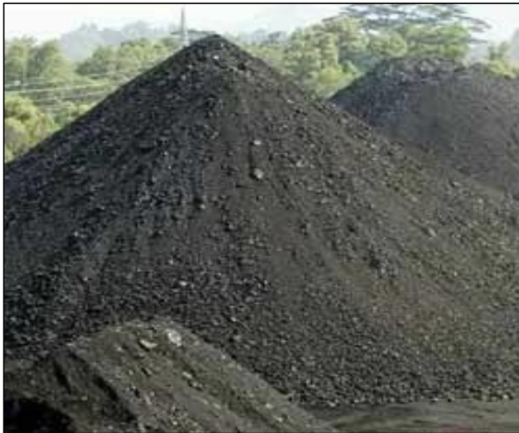
Figure 1. Reject Coal

Even though active disposal is the main choice for dealing with rejected coal, this approach is not always efficient, especially when the amount of rejected coal produced is very large. In addition, transporting reject coal to active disposal requires high transportation costs, which can affect mining companies' operational costs. In some cases, the distance between the mine and active disposal can be very large, increasing the costs and environmental impact of transportation, on the other hand, the potential for using rejected coal as an organic fertilizer has emerged as an attractive alternative. Processing rejected coal into useful organic fertilizer can reduce the amount of rejected coal that must be transported and disposed of for active disposal. Organic fertilizer produced from rejected coal has the potential to increase agricultural soil fertility and reduce dependence on synthetic chemical fertilizers.